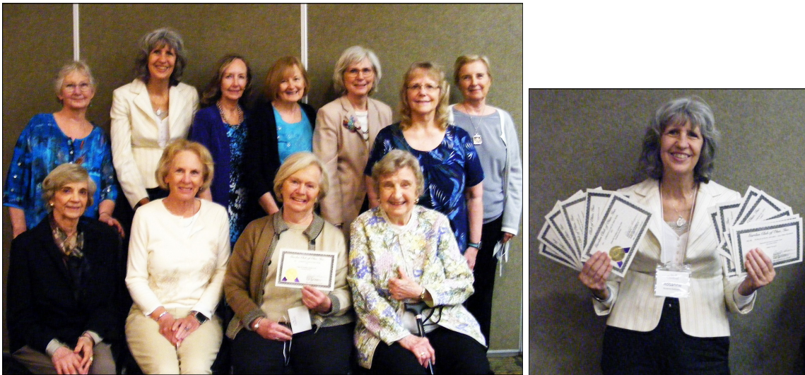
ENGc members at the GCO convention luncheon celebrate being named 2023 Garden Club of the Year