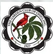
Garden Club of Ohio, Inc.

Emerald Necklace Garden Club is a Member of