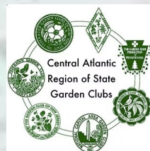
Central Atlantic Region of State Garden Clubs Inc.