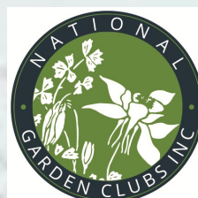
National Garden Clubs